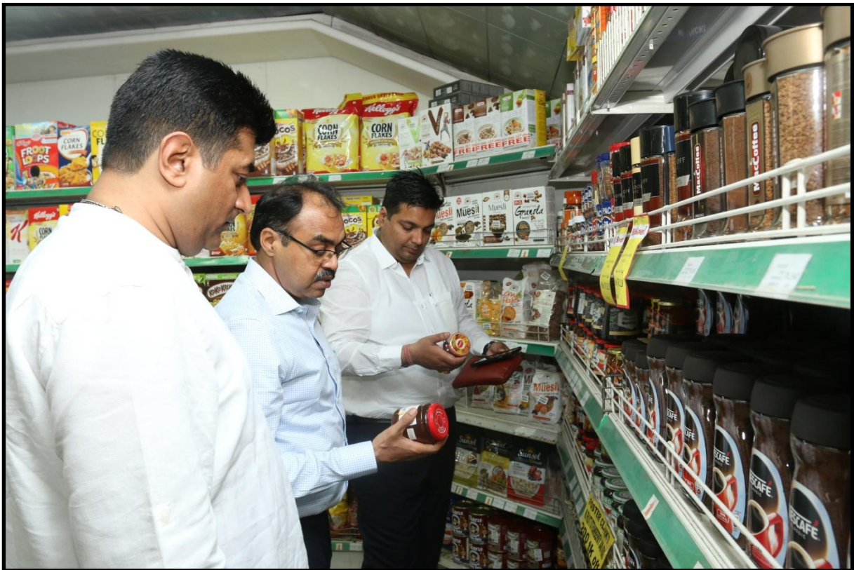
(Processed Food Exporters trying to understand the various imported processed food products at the store)