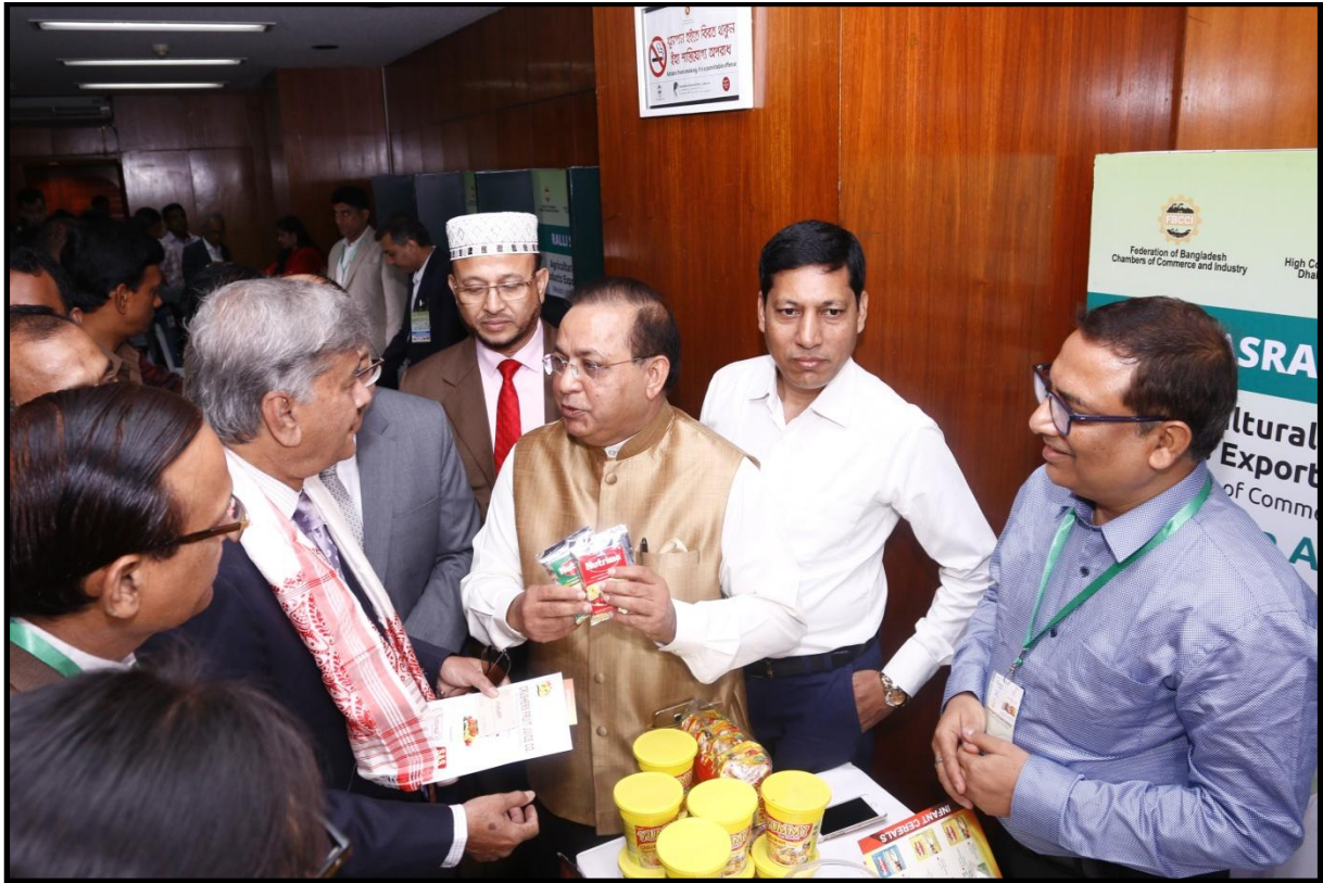
(Interaction with the participants)