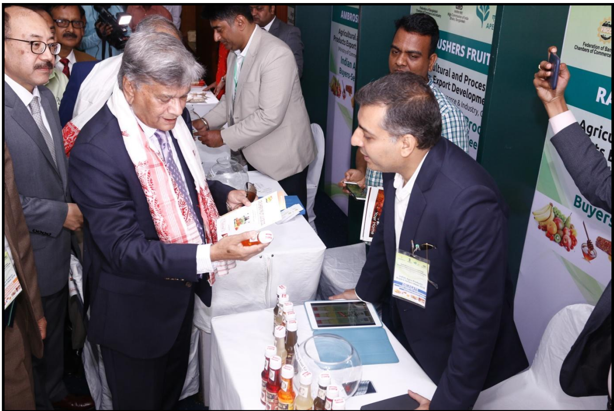
(Interaction with the participants)