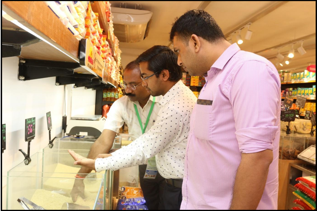
(Rice exporters trying to understand the rice variants)