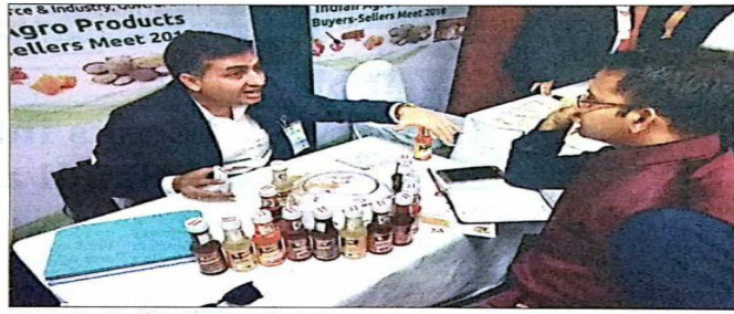
A two-day 'Indian Agro Products Buyers-Sellers Meet' began at a city hotel on Sunday.

"We do not have secondary industry like processing that is very important and necessary. We have the opportunity to collaborate with India," he said. India has the technology