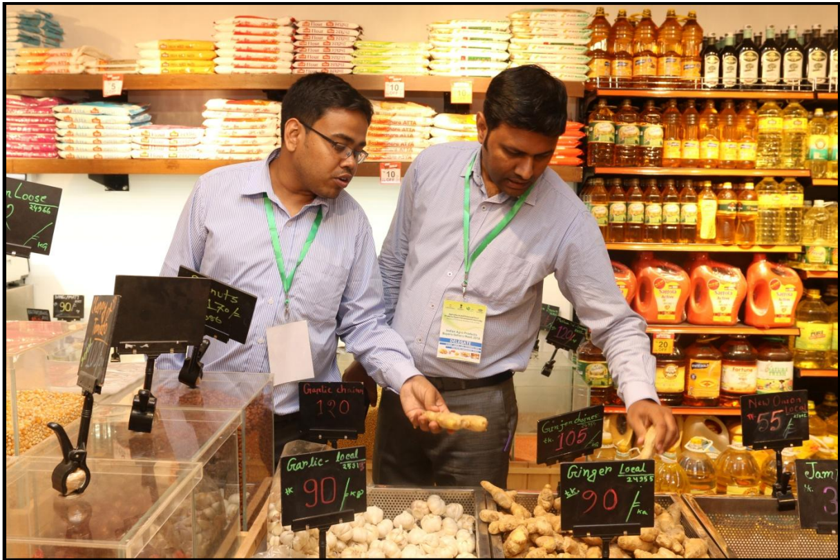
(North East exporters trying to assess the quality of fresh ginger)

In order to understand the products imported by Bangladesh and the product matrix, the exporters was taken to fruit and vegetable market and super markets to have a firsthand view of the available commodities in the market.