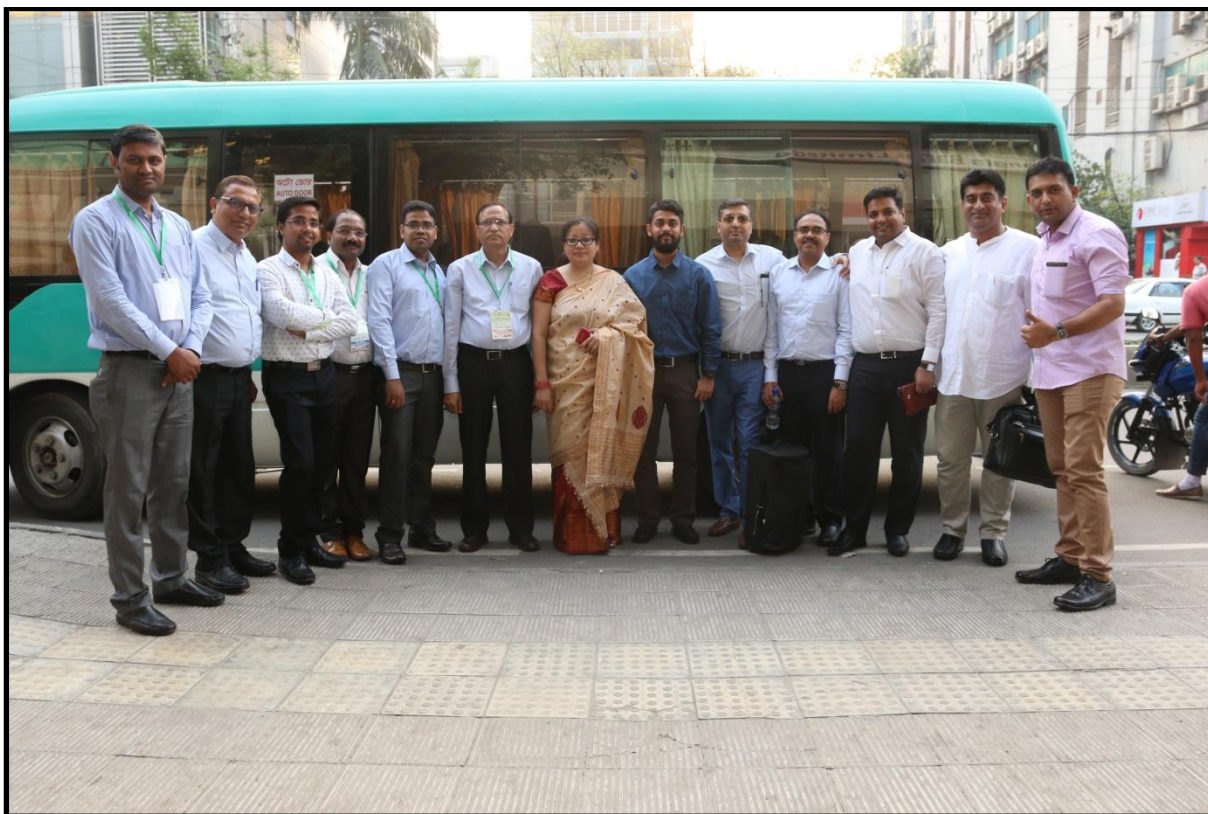
(Participants after the Market Visit)