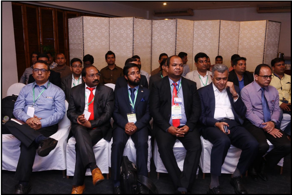
(Participants from India)