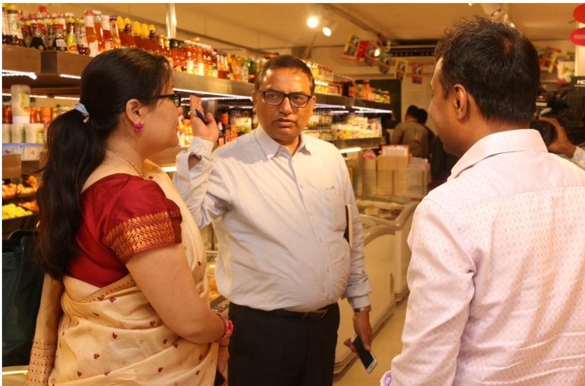
(Interaction with the exporters)