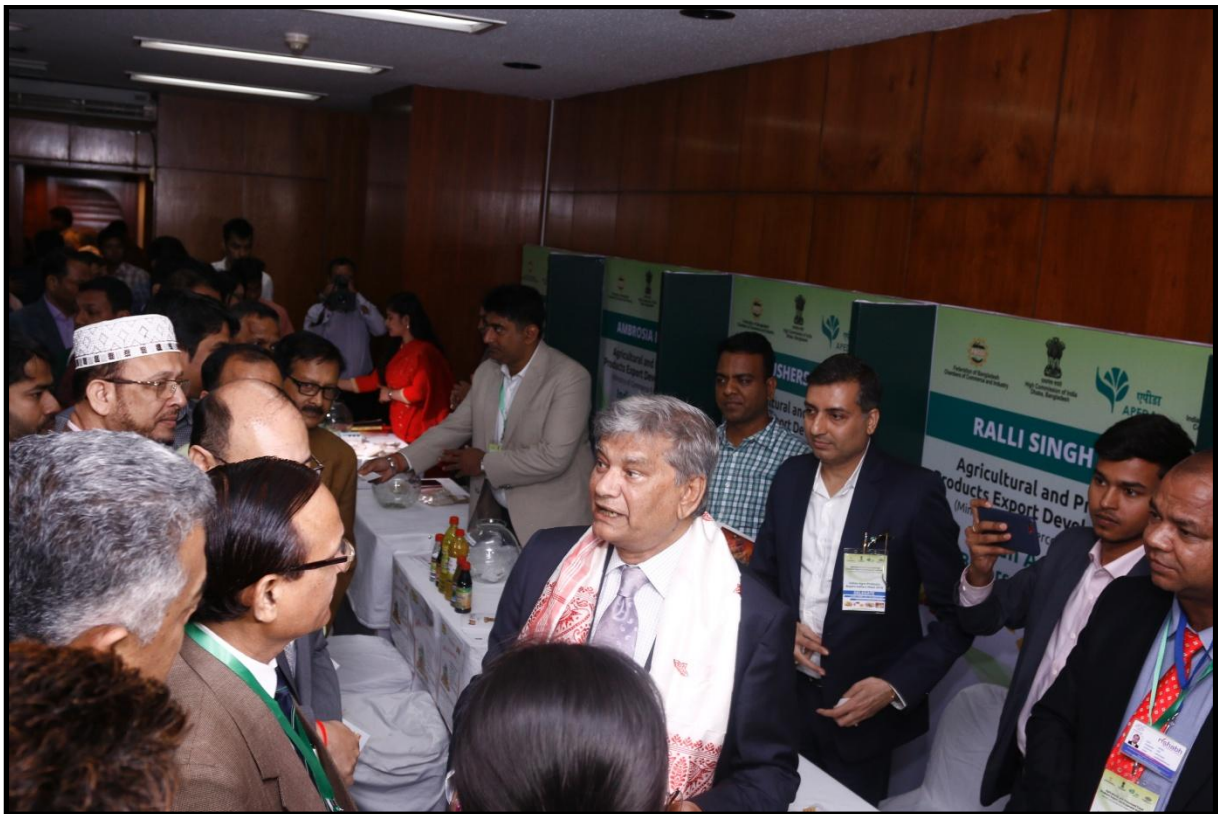
(Interaction with the exporters)