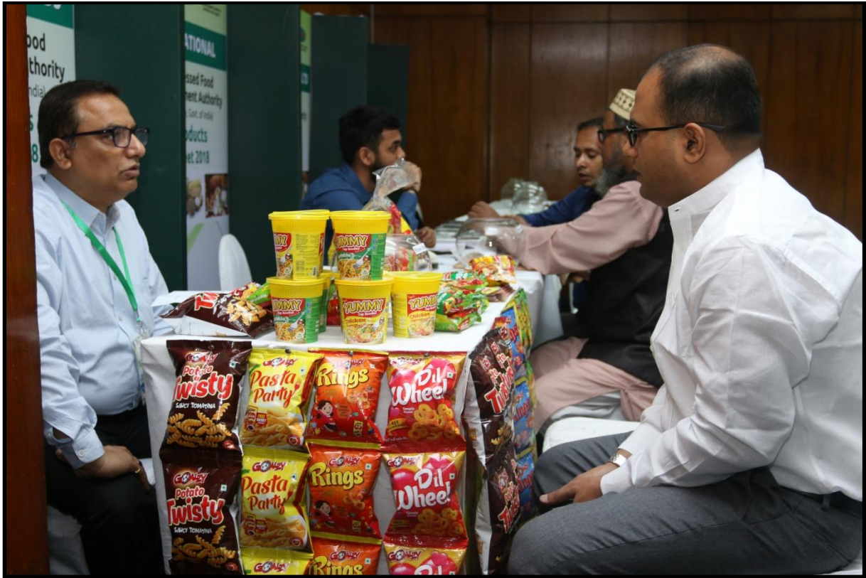
(One to One interaction: Buyer-Seller)