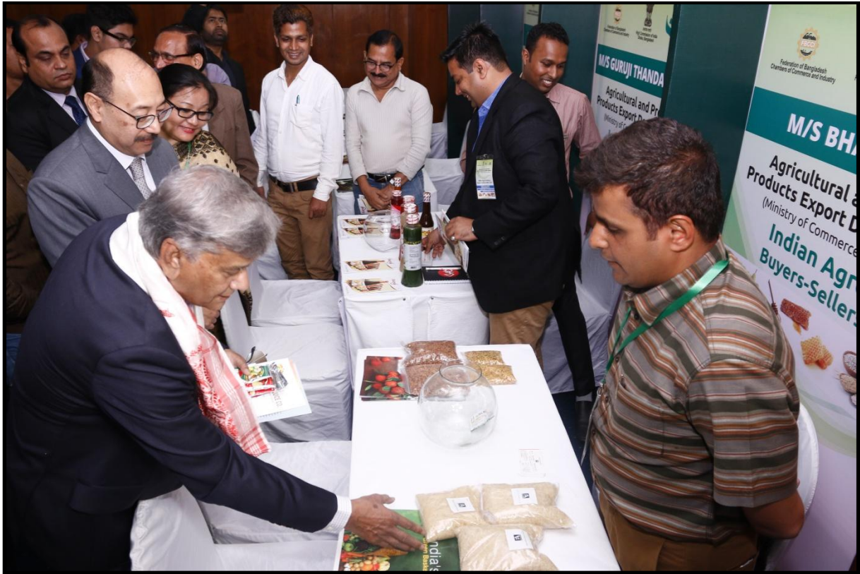
(Visit to the BSM booths)