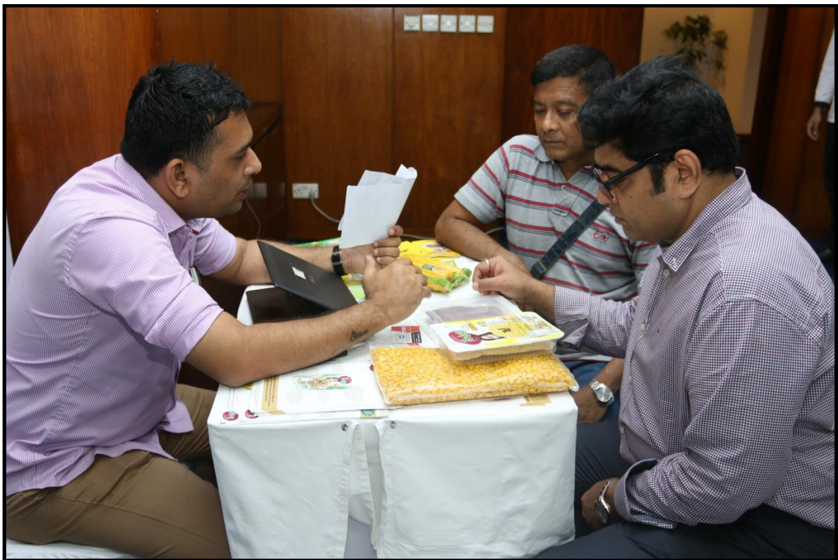
(Business to Business)