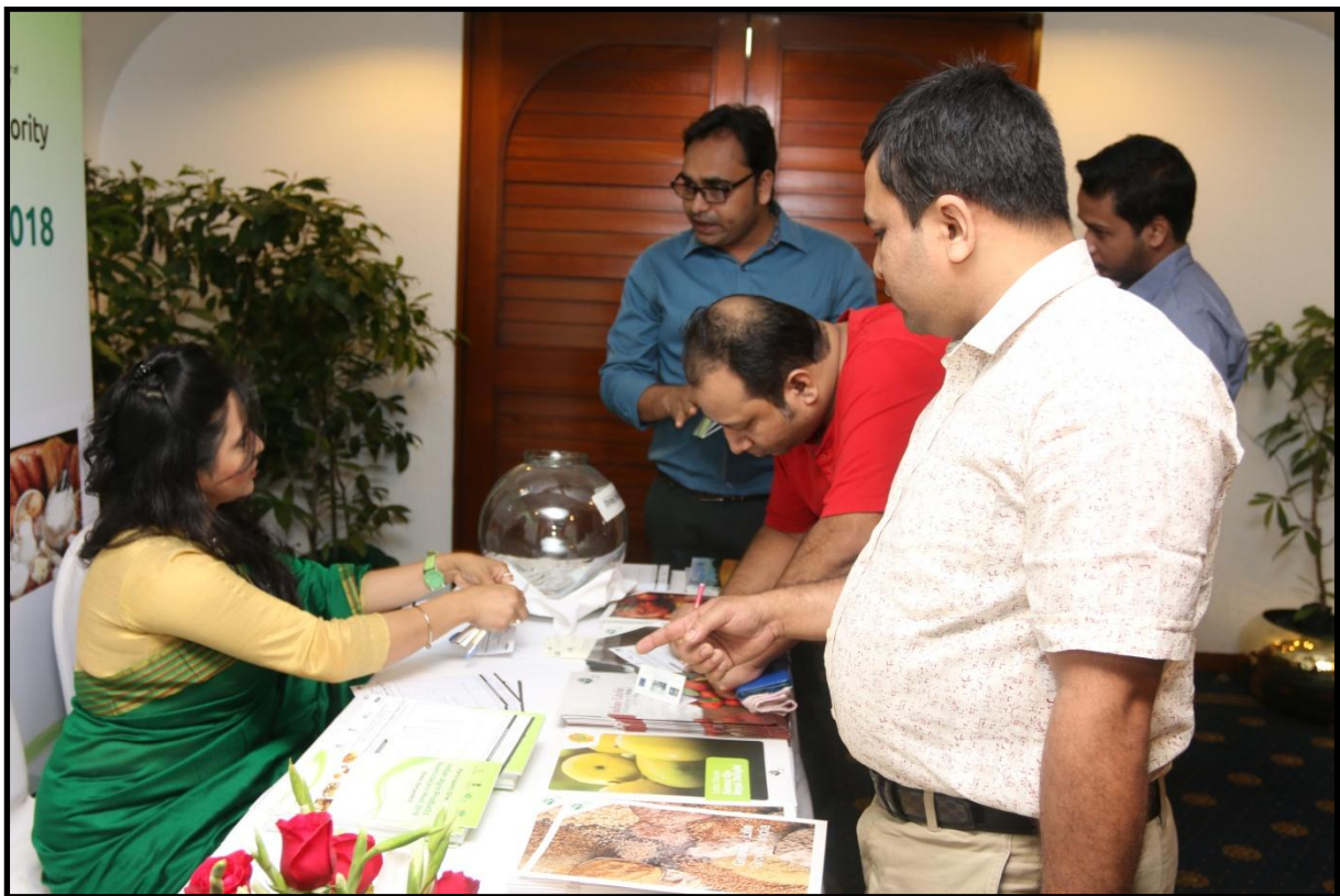
(Registration of Buyers)